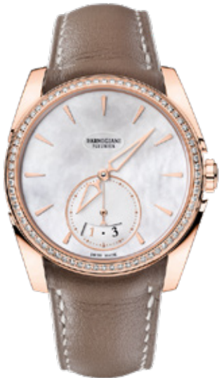
Ø 33 mm Rose gold set white mop PFC273-1063300-HC6121

CASE SPECIFICATIONS Thickness: 8.65 mm Material: 18ct rose gold Water-resistance: 30 m Back: Sapphire Glass: Anti-reflective sapphire