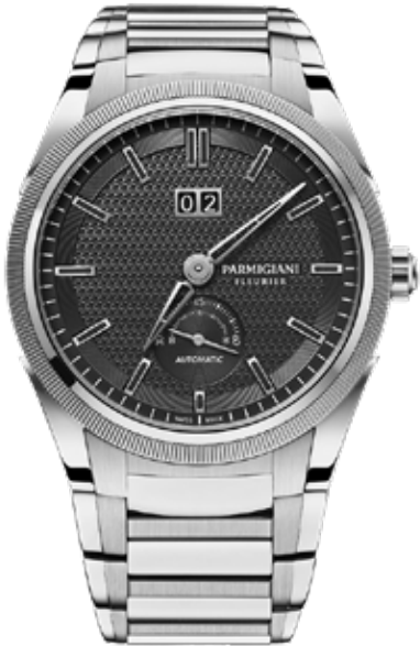
Steel silver black PFC910-0000210-B00182

The Tonda GT family features a 42 mm case, forged in polished and satin-brushed 18ct rose gold, and boasting a water resistance of 100 meters. Its silver-and-black dial adorned with Clou Triangulaire texture has rhodium-plated black indices. The familiar delta-shaped hands tipped with black coating display the time while the date appears prominently in a large double aperture at 12 o'clock.