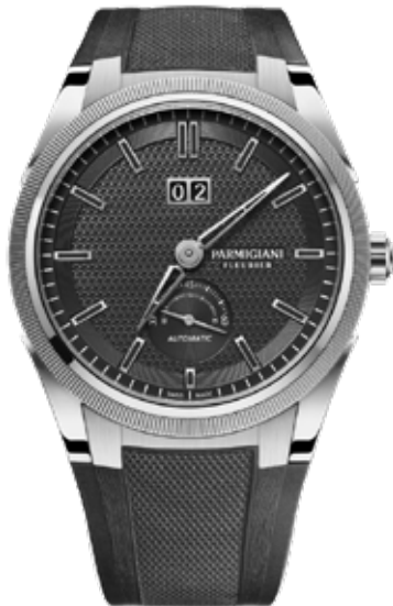
Steel silver black PFC910-0000210-X01482

DIAL SPECIFICATIONS Colour: Black Index: Rhodium plated appliques with luminescent coating Finishing: “guilloché Clou Triangulaire” Hands: Delta-shaped with luminescent coating