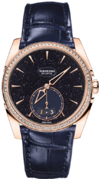
Ø 33 mm Rose gold set blue PFC273-1062500-HA3121

Caliber: PF310 Total dimensions: 10 1/2" – Ø 23.9 mm Frequency: 4 Hz – 28'800 A/h Winding: Automatic Power reserve: 50 hours No. of components: 189 No. of jewels: 28 Thickness: 3.9 mm