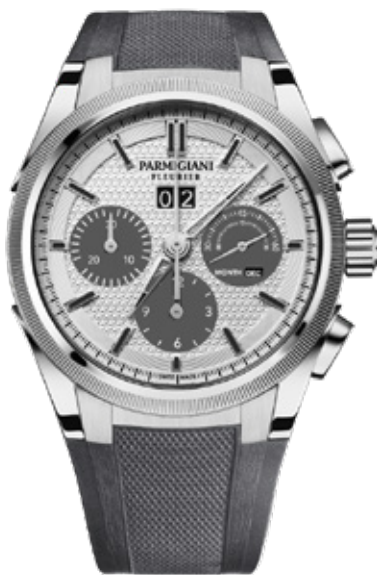
Steel silver grey PFC906-1020002-400181

Colour: Rose gold Index: Rhodium plated appliques with luminescent coating Finishing: “guilloché Clou Triangulaire” Hands: Delta-shaped with luminescent coating