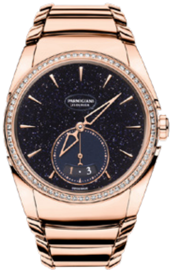
Ø 33 mm Rose gold set blue PFC273-1062500-B10002

With its refined aesthetics, the Tonda Métropolitaine cannot fail to impress with its elegance and sobriety. This creation, with its superbly crafted automatic movement, features a modern urban style that embodies today's active woman to perfection.