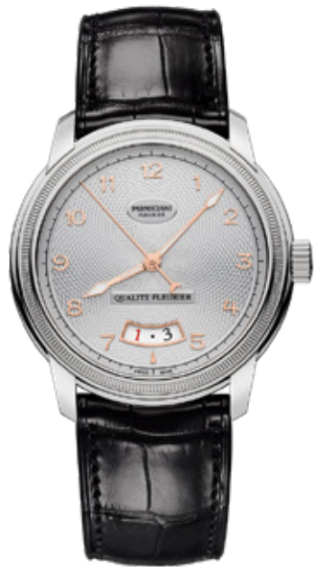
White gold silver guilloché PFC422-1200100-HA1441

The Toric Qualité Fleurier comes with a promise: that of unrivalled craftsmanship and timekeeping performance. Established by Michel Parmigiani in 2004, Fleurier Quality certification has become the most demanding certification in the watchmaking world, and represents a brand of unquestionable prestige for the Toric – the first watch ever created by Parmigiani Fleurier.