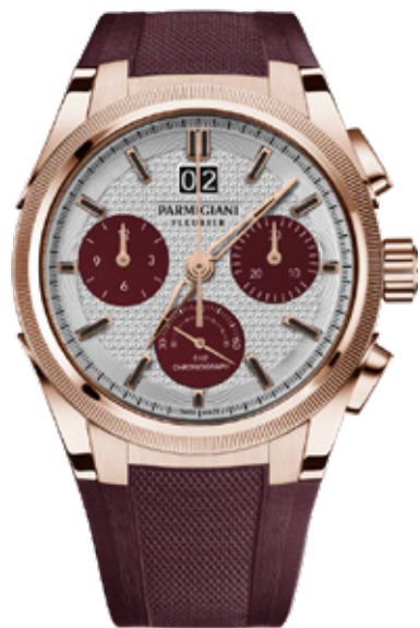
Rose gold silver granata PFC903- 2020002-400181

Colour: Rose gold Index: Rhodium plated appliques with luminescent coating Finishing: “guilloché Clou Triangulaire” Hands: Delta-shaped with luminescent coating