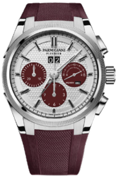
Steel silver granata PFC906-1020002-400181

Color: silver & Granata Finishing: clou triangulaire guilloché Indices: hand-applied 18ct rose gold appliques with black luminescent coating