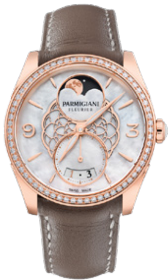
Ø 33 mm Rose gold set white mop PFC810-1510020-HC6181

Thickness: 9.5 mm Material: 18ct rose gold Water-resistance: 30 m Back: Sapphire Glass: Anti-reflective sapphire