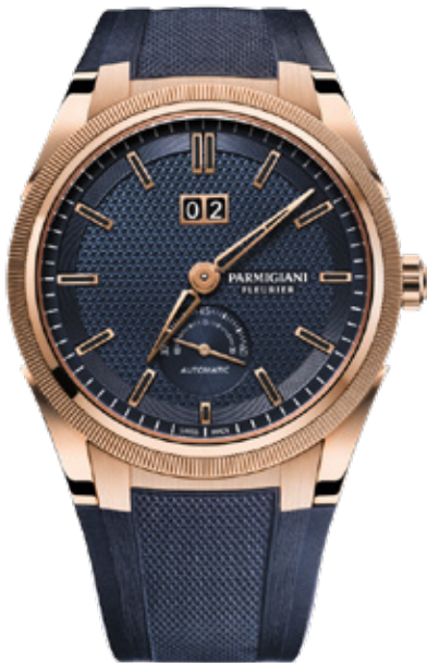
Rose gold blue PFC910-1500340-X03182

CASE SPECIFICATIONS Dimensions: 42.00 mm Material: 18ct rose gold Thickness: 11.2 mm Water-Resistance: 100 m Glass: ARunic anti-reflective sapphire Back: Sapphire