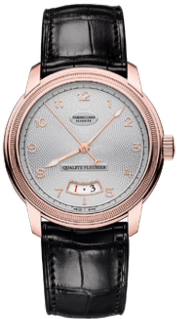
Red gold silver guilloché PFC422-1600100-HA1441

MOVEMENT SPECIFICATIONS Caliber: PF331-QF Total dimensions: 11 1/2''' – Ø 25.6 mm Frequency: 4 Hz – 28'800 A/h Winding: Automatic Power reserve: 55 hours No. of components: 220 No. of jewels: 32 Thickness: 3.5 mm