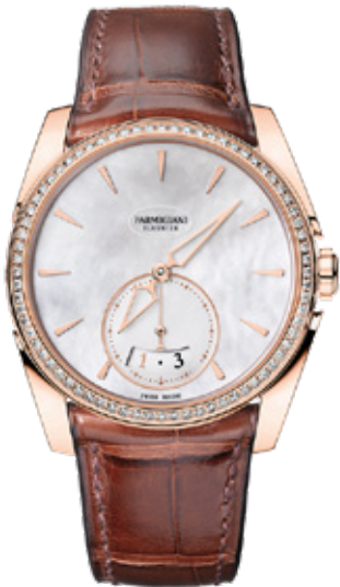
Ø 33 mm Rose gold set white mop PFC903-1500340-X03182

DIAL SPECIFICATIONS Colour: White Mother-of-pearl Index: 18-ct rose gold appliques Finishing: Mother-of-Pearl Hands: Delta-shaped with luminescent coating