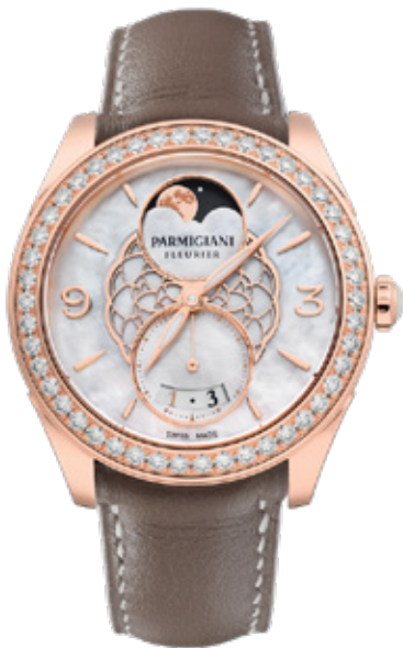
Ø 36 mm Rose gold set white mop PFC811-1510020-HC6181

Caliber: PF318 Total dimensions: 11 1/2" – Ø 26.0 mm Frequency: 4 Hz – 28'800 A/h Winding: Automatic Power reserve: 50 hours No. of components: 205 No. of jewels: 28 Thickness: 4.7 mm