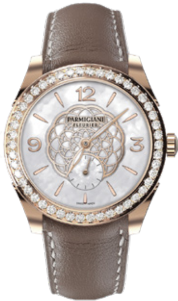
Ø 36 mm Rose gold set white mop PFC801-1510020-HC6181

MOVEMENT SPECIFICATIONS Caliber: PF310 Total dimensions: 10 1/2" – Ø 23.9 mm Frequency: 4 Hz – 28'800 A/h Winding: Automatic Power reserve: 50 hours No. of components: 189 No. of jewels: 28 Thickness: 3.9 mm