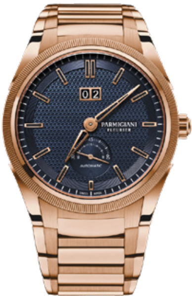
Rose gold blue PFC910-1500340-B00782

MOVEMENT SPECIFICATIONS Caliber: PF044 Total dimensions: 30.0mm Frequency: 28,800 Vph (4 Hz) Winding: Automatic Winding Manufacture Movement Power reserve: 45 hours No. of components: 274 No. of jewels: 33 Thickness: 5.3mm