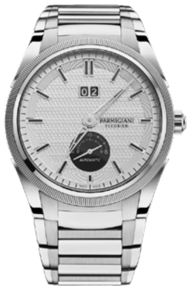
Steel silver black cyclope PFC910-0000141-B00182