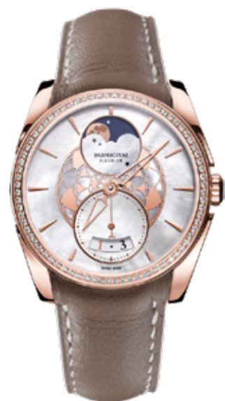
Rose gold set white mop PFC283-1063300-HC6121

Colour: White Mother-of-pearl Index: 18-ct rose gold appliques Finishing: Azur outer, gold lacework center, opaline counters Hands: Skeleton Delta-shaped