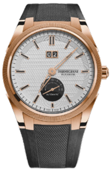
Rose gold silver black cyclope PFC910-1500140-X01482

Colour: silver with black subdial Index: hand-applied 18-ct rose gold appliques Finishing: guilloché clou triangulaire Hands: Skeletonized delta-shaped