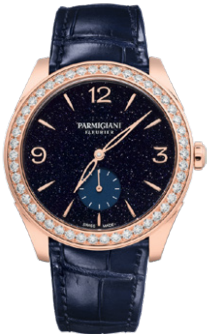
Ø 36 mm Rose gold set PFC801-1510320-HA3181

Colour: Blue aventurine Index: 18-ct rose gold appliques Finishing: Polished Hands: "Leaf" shaped