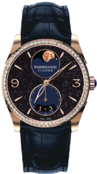
Ø 33 mm Rose gold set aventurine PFC810-1510320-HA3181

Colour: White Mother-of-pearl Index: 18-ct rose gold appliques