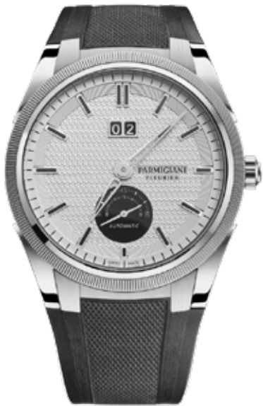
Steel silver black cyclope PFC910-0000141-X01482

Caliber: PF044 Total dimensions: Frequency: 4 Hz - 28'800 A/h Winding: Automatic Power reserve: 45 hours No. of components: 274 No. of jewels: 33 Thickness: 5,3 mm