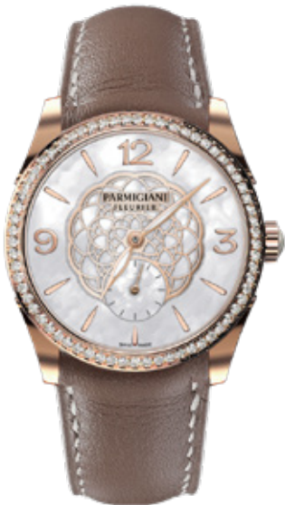
Ø 33 mm Rose gold set white mop PFC903-1500140-B10082

Parmigiani Fleurier presents a new Tonda Métropolitaine version with a feminine timepiece that marries a white mother-of-pearl dial with a diamond-set bezel. The Tonda Métropolitaine Rose Gold Set White Mother-of-Pearl combines the iridescent reflections of organic material with the brilliance of mineral material.