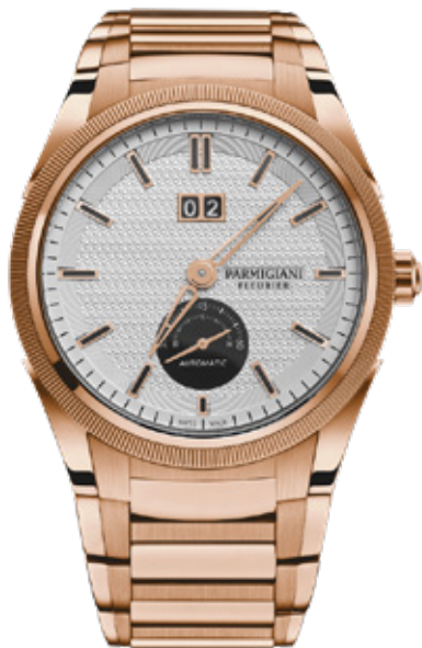
Rose gold silver black cyclope PFC910-1500140-B10082

Colour: silver with black subdial Index: hand-applied 18-ct rose gold appliques Finishing: guilloché clou triangulaire Hands: Skeletonized delta-shaped