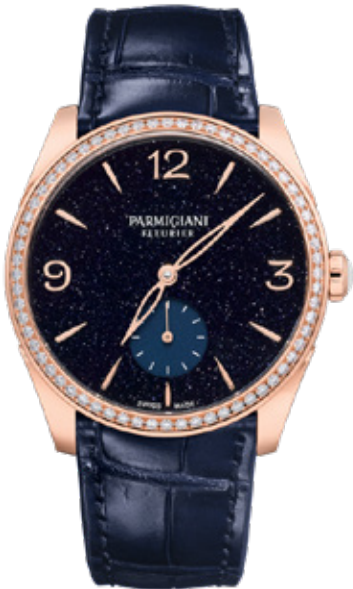
Ø 33 mm Rose gold set PFC800-1510320-HA3181