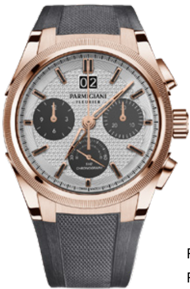
Rose gold silver grey Ref: PFC903- 2020001-400181

Polished and satin-finished 18ct rose gold with knurled bezel and stainless steel Diameter: 42 mm Thickness: 14.3 mm Crown: Ø 7.2 mm, screwed-in Glass: ARunic anti-reflective sapphire Case back: sapphire glass Engraving on case back: serial number Water resistance: 100 m